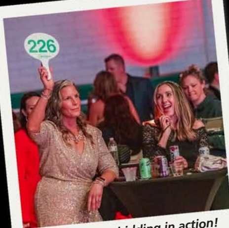
Live Auction bidding in action!

FUND-A-NEED: The auction was a huge success, but we are still striving to reach our $25,000 goal for the playground Fund-A-Need by installing equipment specifically designed for those with special needs. To give: Make checks out to St. Brendan Home & School Association with "Fund-A-Need" on the memo line; Through your PushPay account (scan the QR code); Via the Auction Give Smart at https://tinyurl.com/stbplayground