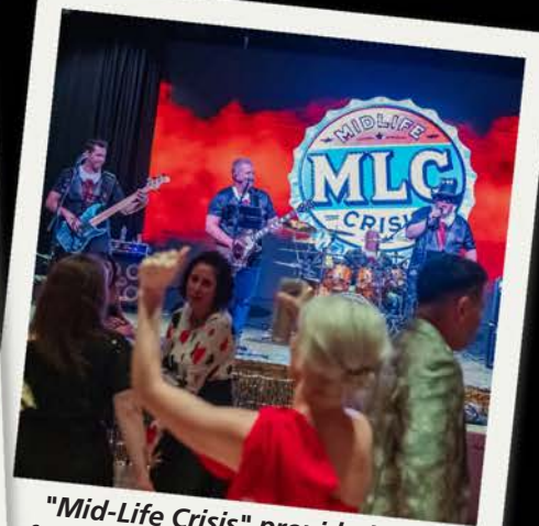
"Mid-Life Crisis" provided music for dancing during the after-party.